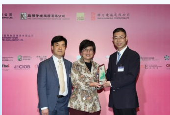
Theme Award Gold (Residential) - Hang King Garden Hang Luen Cheong Property Mgt Co Ltd