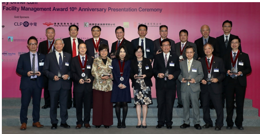
EFMA & Theme Award 10th Anniversary Jury Panel