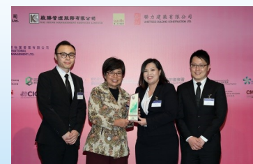
Theme Award Gold (Institutional & Others) - The Johnston Sino Estates Management Ltd