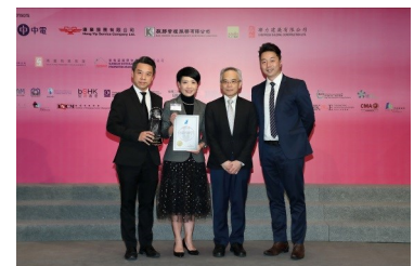
Grand Award - Vision City Sino Estates Management Limited