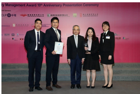
EFMA 10th Anniversary Honorary Award - Citywalk Citywalk Management Company Limited

To celebrate its 10th Anniversary and encourage upkeep of professional practice, the EFMA 10th Anniversary Honorary Award is presented to one of the past Grand Awardees that would be able to demonstrate continuous upgrading in service quality after attainment of the Grand Award.