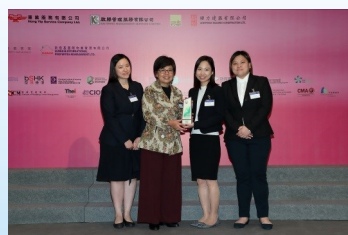
Theme Award Gold (Commercial) - Citywalk 2 Citywalk 2 Management Company Ltd