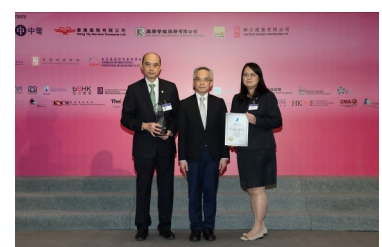
Grand Award - Tin Shing Court Kai Shing Management Services Ltd