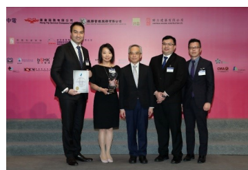
Grand Award - Mount Nicholson Nan Fung Property Management