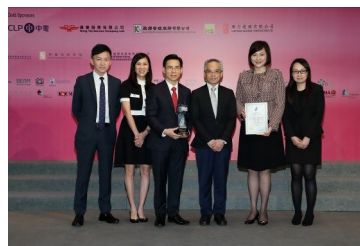
Grand Award - Century Link Royal Elite Service Company Limited